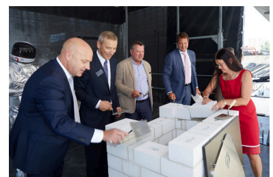
Time capsule gets immured into the foundation stone