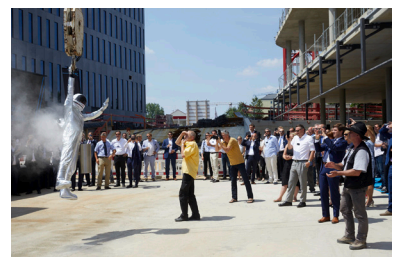
Landing of the Martian