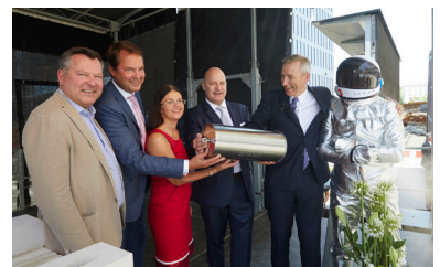
Laying of the foundation stone for the Bavaria Towers