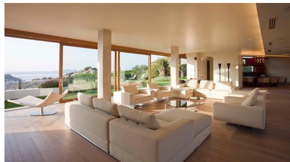
Seaview trophy estate in Porto Cervo, Costa Smeralda